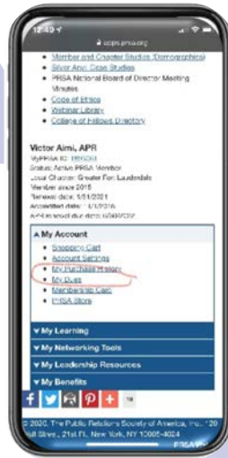
2. Scroll down to "My Account" and tap "My Dues"